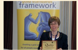
Layer Road Surgery, Essex

"GSF has been transformational for us as a practice and for our patients."